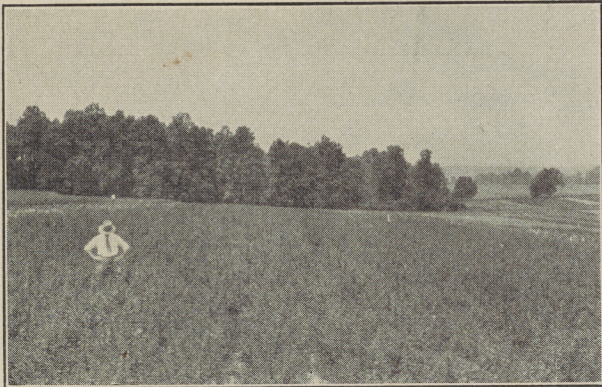
Hugonis, July 11, 1929. Now almost waist high

Sprightly Specimens and Bang-up Borders "Golden Shrub-Rose of China." 2 year, field plants (O) 100 1000 1½ to 2 ft..... $30.00 $250.00 2 to 3 ft..... 40.00 350.00